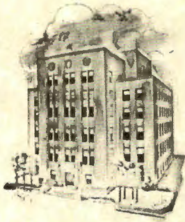
HARRISON COUNTY COURT HOUSE